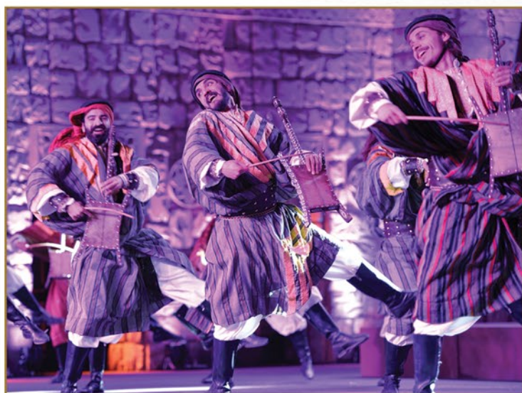
Jollanar Dance Theatre

On Monday, April 15th, I arrived from Australia and travelled out to the Old Damascus Fairground to see how things were shaping up for the Official Opening the next night. There was a hive of activity putting finishing touches to the Traditional Hand Craft Fair and Traditional Food Fair pavilions, plus other sections, including the stage where the Jollanar Dance Theatre entertained us nightly with energetic folklore shows. These exhibitions and activities were important drawcards for the people of Damascus to visit the festival, where they could rekindle interest in their heritage and their Arabian horses. The festival's organizers did a sterling job pulling it all together, as they only had a few short weeks to prepare for the event. Two weeks prior to my arrival, the grounds were covered in rubble which took 500 truckloads to remove!