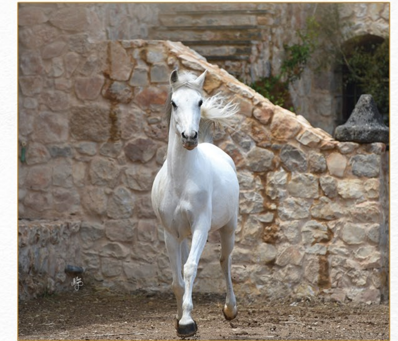
From top: The pure Syrian mare Dahmaa Amer; The stallion Taj Al Khair; The filly Samar - All photographed at Al Jadaan Stables

In the afternoon we attended the Arabian races at Al Demas. It continued raining, turning the track to liquid mud! It even snowed on nearby mountains, but this did not deter Syria's courageous jockeys and horses from participating in the seven races. As the last race was run and won, the sun started shining! Just in time for the exhilarating Equestrian Martial Arts Show, where Arabians and their riders from the Police Equestrian Club performed awe-inspiring feats of horsemanship.