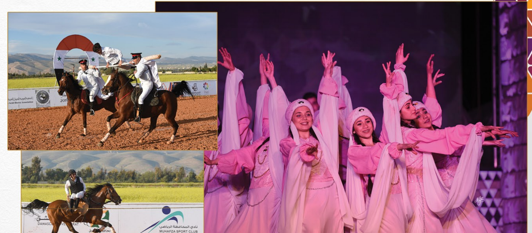
Left: Martial arts; Right: Children at the closing ceremony

The closing ceremony for the festive was held that evening. A highlight being the poignant plays, dances and songs performed by Syrian children from around the country, while films from the past eight years of conflict were shown on a large screen behind them. It brought home how wars affect and traumatize the most innocent and vulnerable people of all, the children. The Al Sham International Arabian Horse Festival was certainly a welcome and fabulous celebration for Syria's jewel in the crown, the Arabian horse. An equine that transcends both religion and politics while giving immense joy to thousands of enthusiasts around the world!