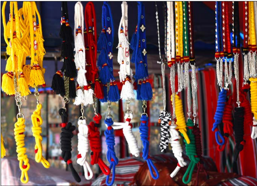
Saddlery for sale.