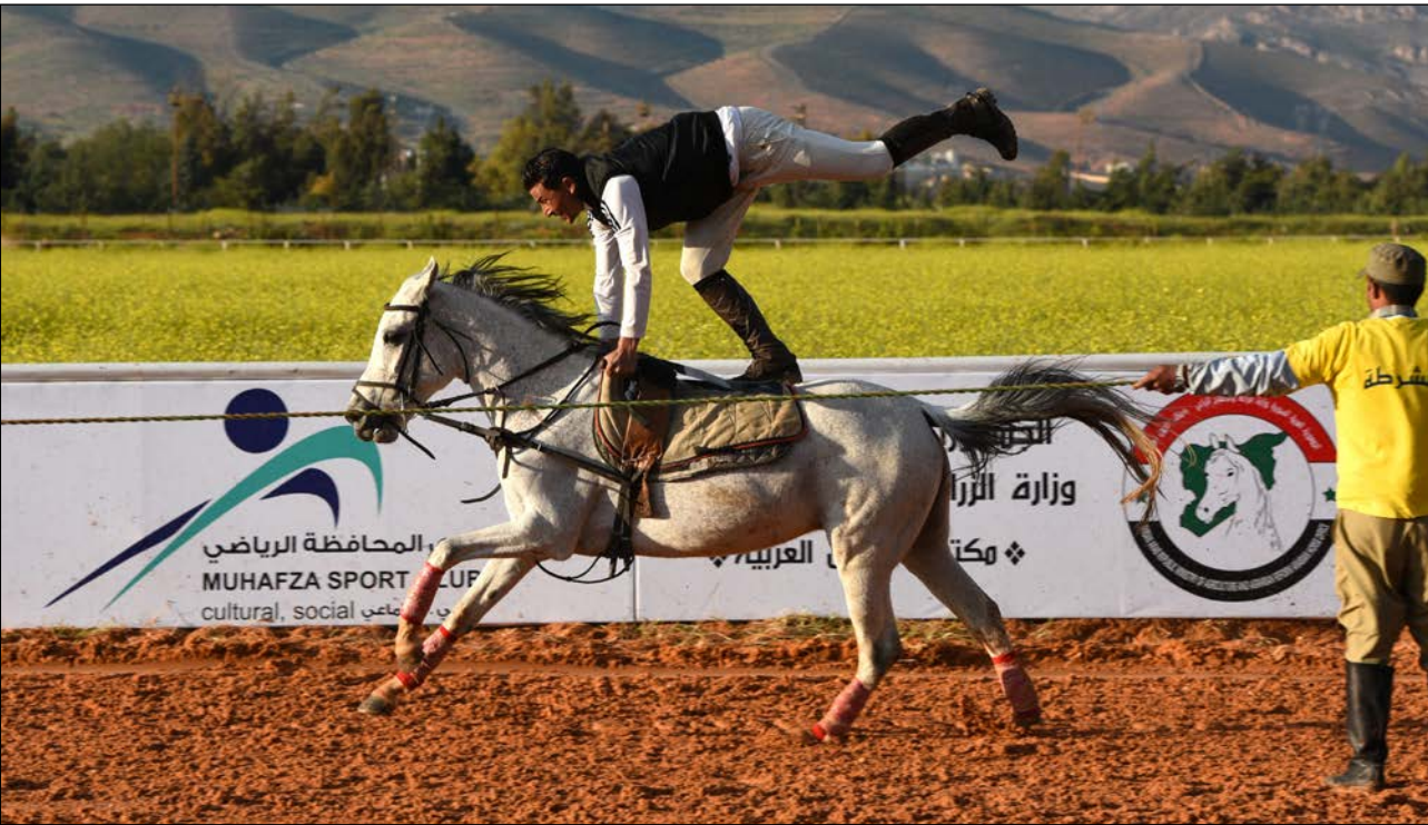
The Police Equestrian Club members performed daring feats of horsemanship.

We visited the medieval tomb of Saladin (1137 – 1193), the first sultan of Egypt and Syria who led the Muslim military campaign against the Crusaders in the Levant. Next we saw the impressive Umayyad Mosque, one of the earliest and most important Islamic religious structures in the world. This beautiful mosque is where a shrine is purported to enclose a relic honoured by Muslims as well as Christians, the head of St. John the Baptist.