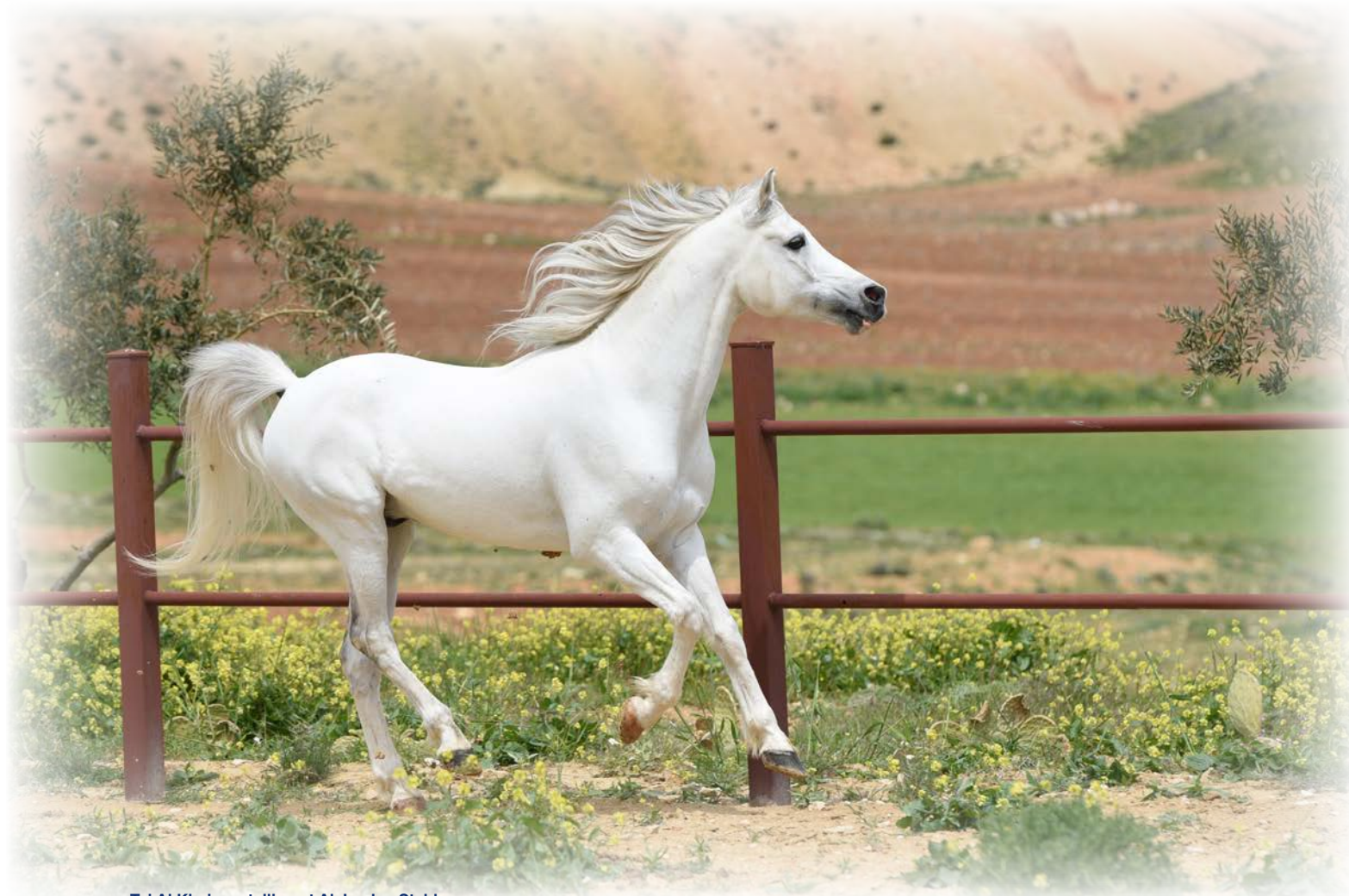
Taj Al Khair, a stallion at Al Jaadan Stables.