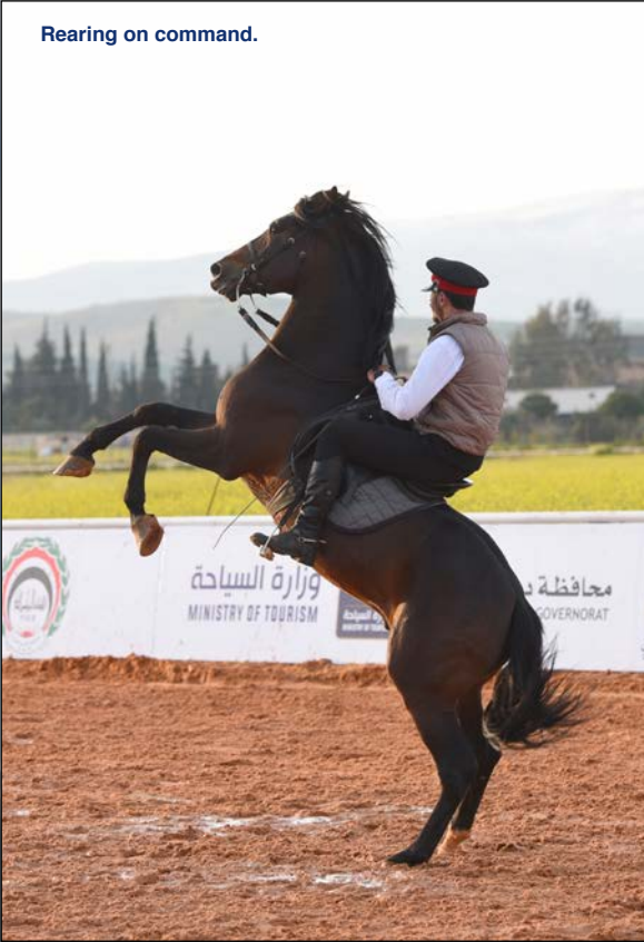
Rearing on command.