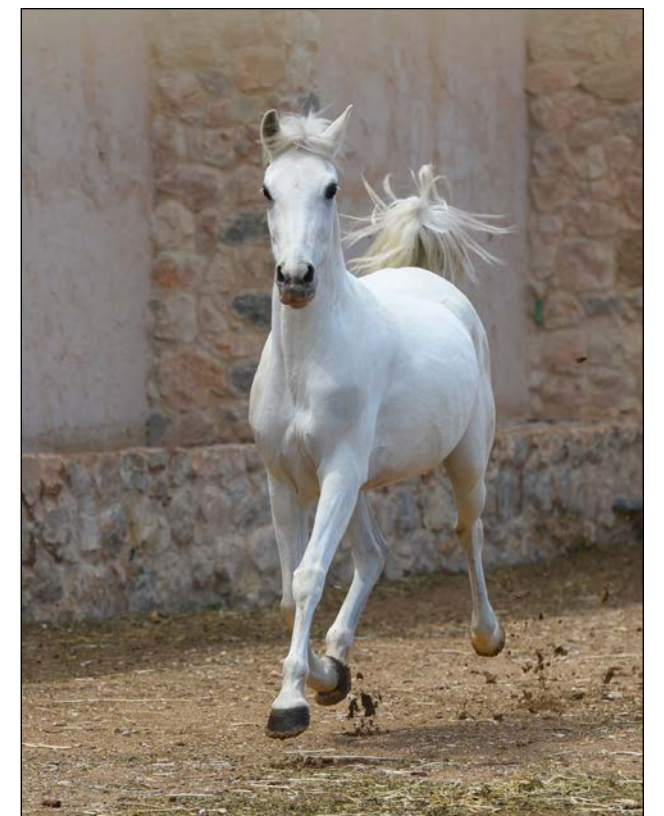
The Syrian mare Dahmaa Amer at Al Jaadan Stables.