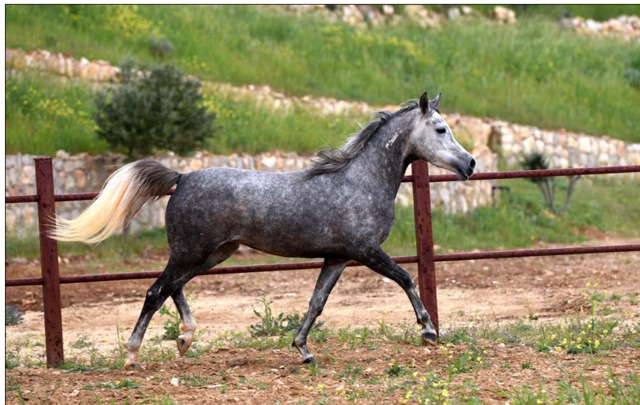
The filly Samar at Al Jaadan Stables.