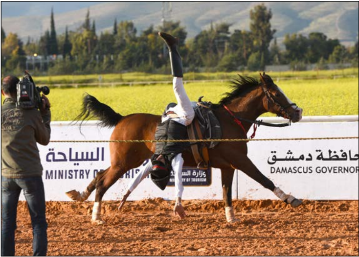
Arabian horses have amazing temperaments.