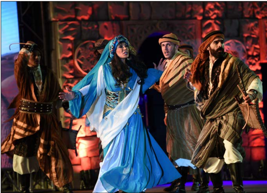
Jollanar Dance Theatre performing a musical about a stolen Arabian horse.