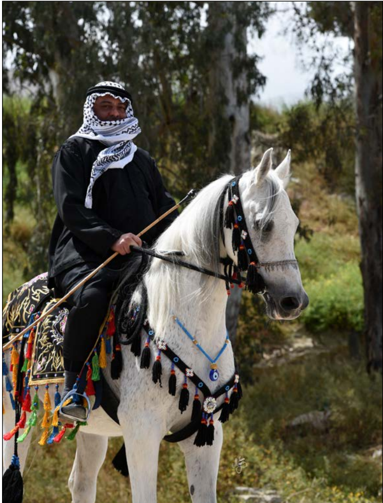
Ready for the The Grand Sham Parade.