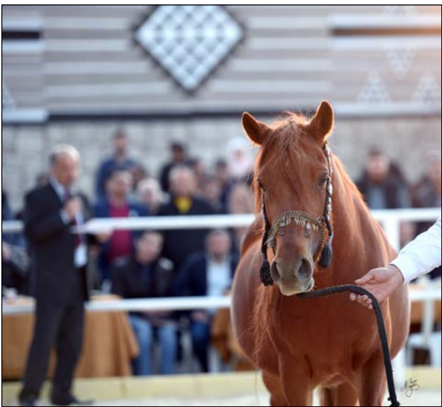
High priced horse at the auction was Safaa Al Sahraa.