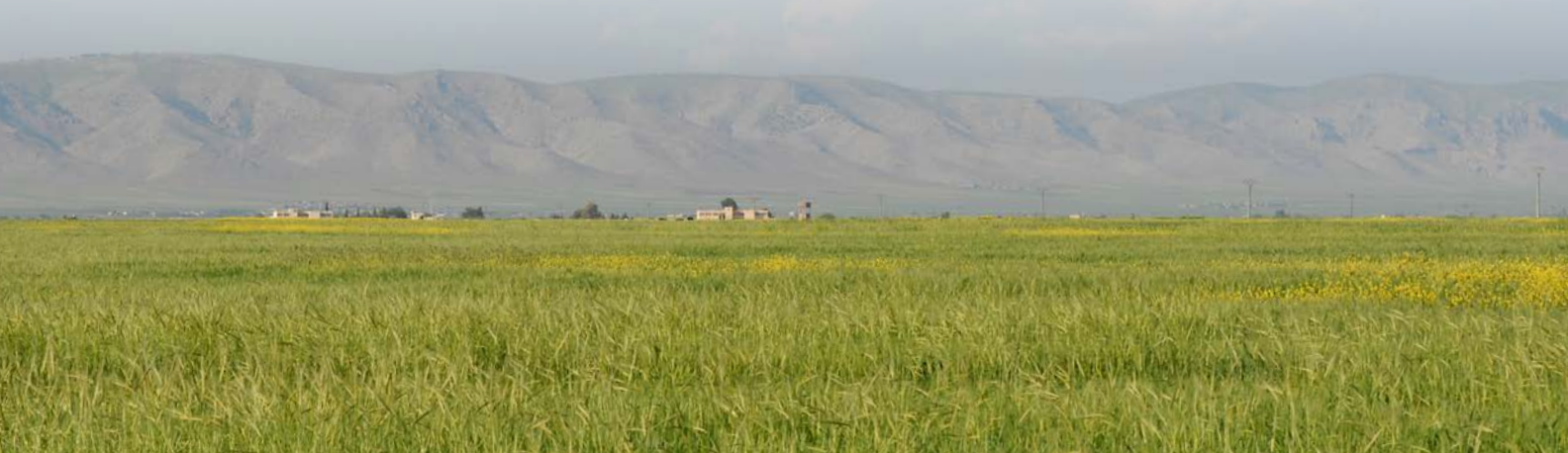
Syria's fertile crescent.

----- *Sharon Meyers is a freelance writer and photographer based in Australia and can be contacted by email at: sharon@meyers.id.au