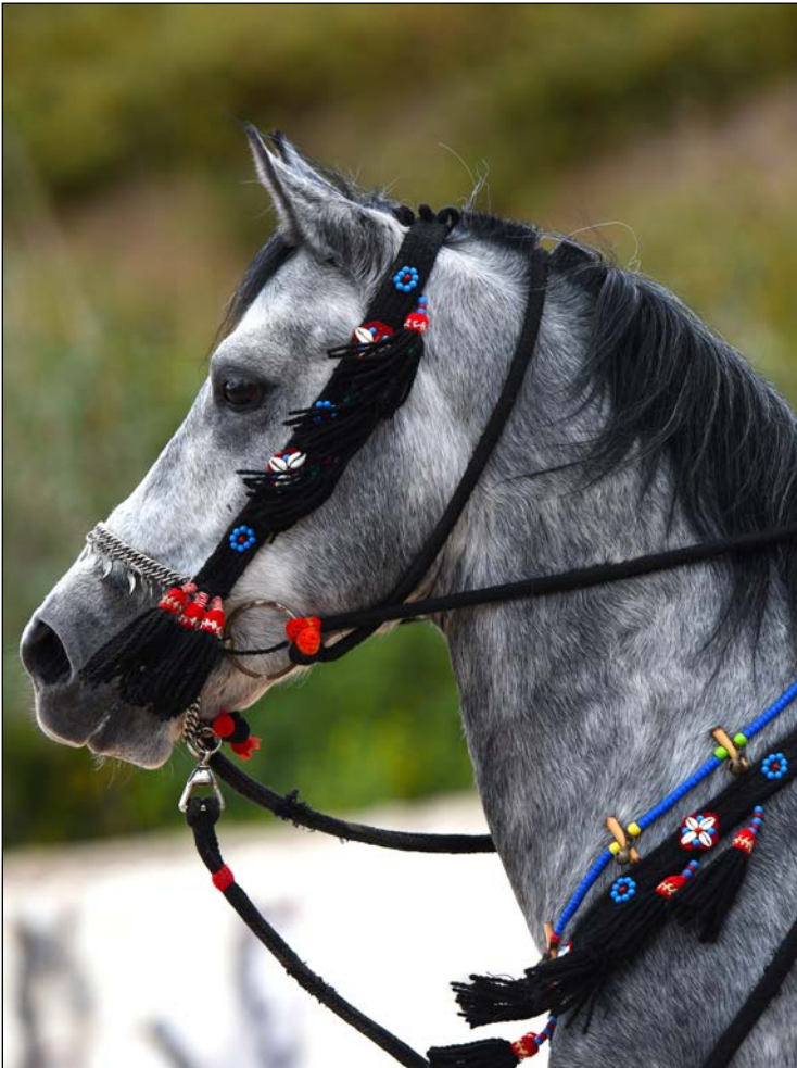
People of Damascus rekindled their interest in Arabians.