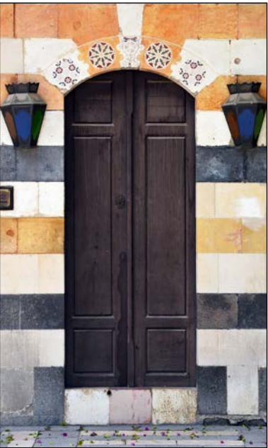
A doorway at the Azem Palace.