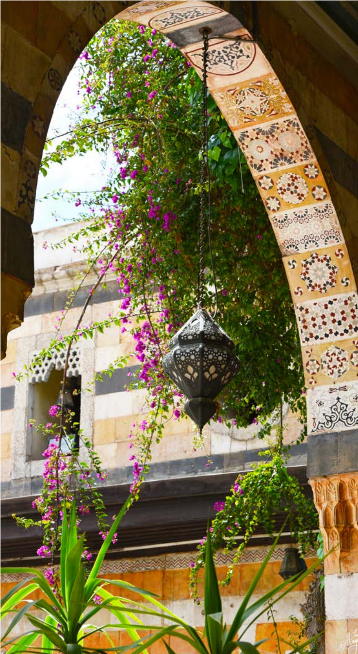
Azem Palace archway.

Thursday afternoon saw an auction for pure Syrian Arabians which created lots of interest with spectators. Three horses sold with the highest price being US$10,000 for the 10-year-old chestnut mare Safaa Al Sabraa (Beebars x Shamet Al Dara'an) of the Keheileh Jreishieh strain. I was pleased to note a couple of the sale horses were sired by stallions or were from mares we saw at the Basel Al Assad State Stud in 2007, which was destroyed but is up and running again. One was the grey 2009 stallion Ghamer Al Ghootah of the Hamdani Ibn Ghorab strain and his sire was the handsome Ma'roof, a grey stallion who impressed us in 2007 with his