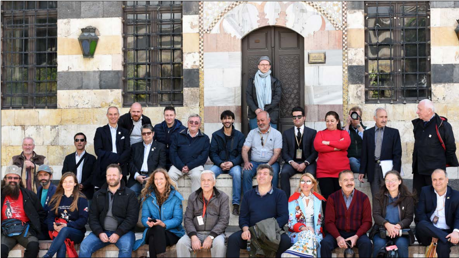
Our group consisting of international visitors and Syrians at the Azem Palace.