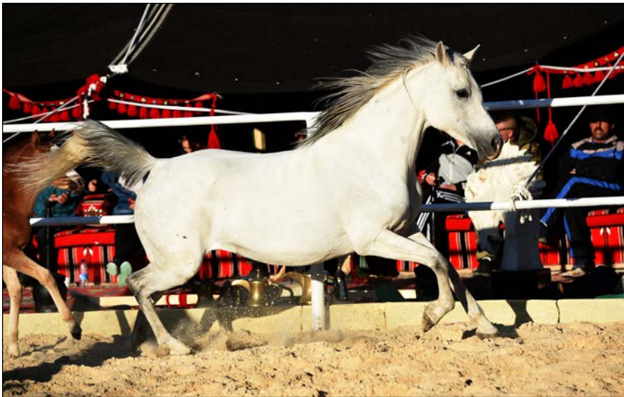
The Syrian mare Sohaila is of the famous Shweimeh Sabbah strain.