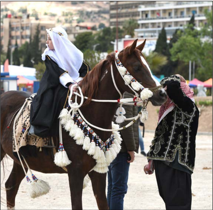
Children also took part in the parade.

On Monday April 15th I arrived from Australia and travelled out to the Old Damascus Fair Ground to see how things were shaping up for the Official Opening the next night. There was a hive of activity putting finishing touches to the Traditional Hand Craft Fair and Traditional Food Fair pavilions plus other sections, including the stage where the Jollanar Dance Theatre entertained us nightly with energetic folklore shows. These exhibitions and activities were important drawcards for the people of Damascus to visit the festival, where they could rekindle interest in their heritage and their Arabian horses.